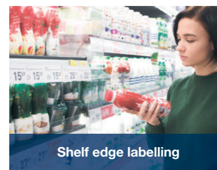
Shelf edge labelling