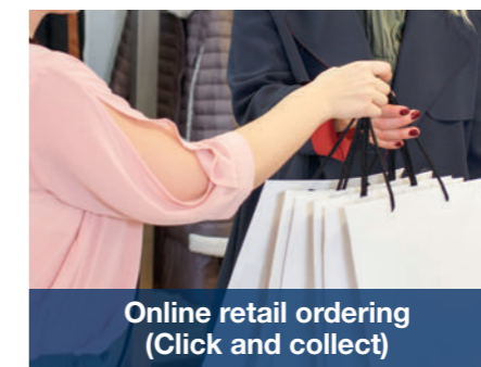
Online retail ordering (Click and collect)