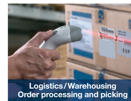
Logistics / Warehousing Order processing and picking